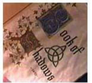
from the "Charmed" TV series

Book of Shadows: coven or group, Evil: The Rise of